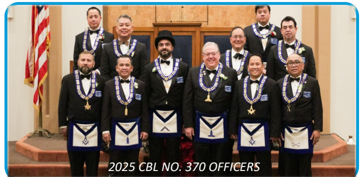
2025 CBL NO. 370 OFFICERS